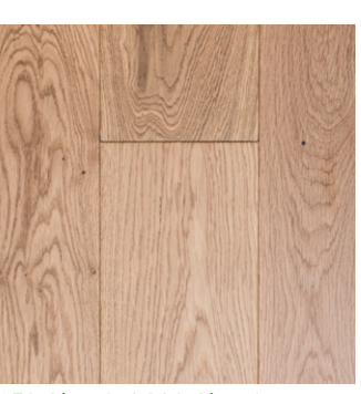
150 Classic | 220 Classic