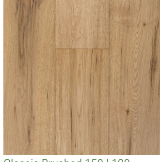
Classic Brushed 150 | 190